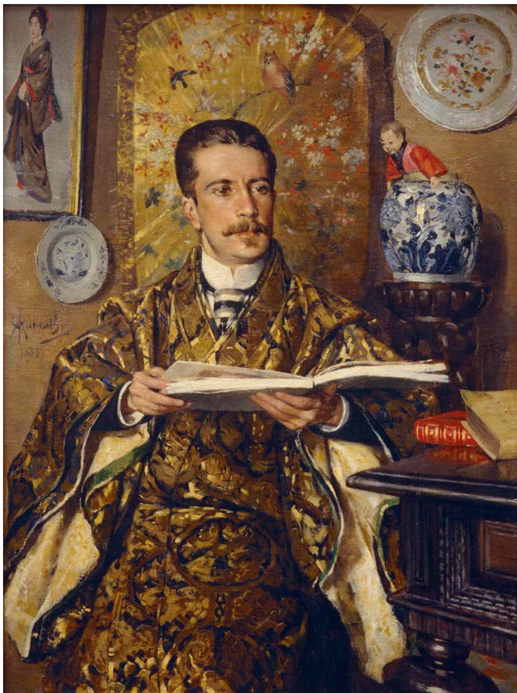
Figure 2. António Ramalho, Retrato de Abel Botelho , 1889, Oil on Canvas, 59 x 44 cm. Museu Nacional de Arte Contemporânea – Museu do Chiado, Lisbon