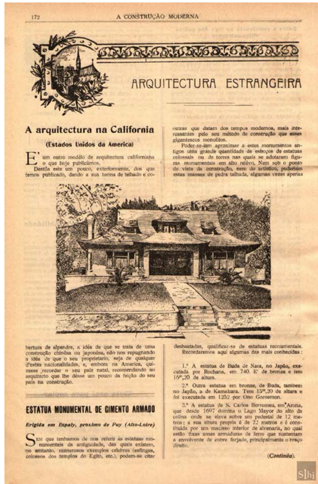
Figure 5. Article “A Arquitectura na California (Estados Unidos da America)” Published in “A Construcção Moderna” in November 25, 1916.