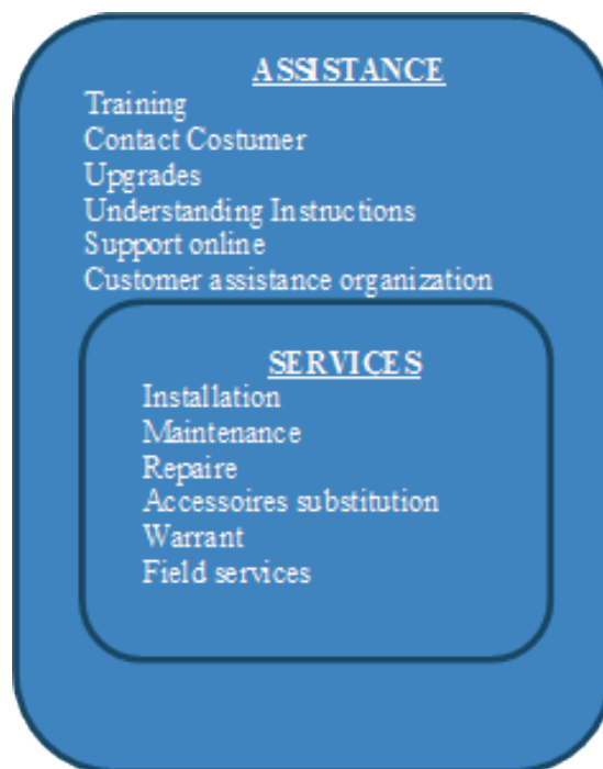
Figure 1: Product support and service (adapted from GOFFIN, 2000).

A research study focuses on a mathematical model of integration and planning of the technical department of the vending machines. Closely, related to preventive maintenance and failures. Planning determines levels of technical work (full-time and temporary), preventive maintenance and repairs to minimize the total cost (KIM, YOO, 2012).